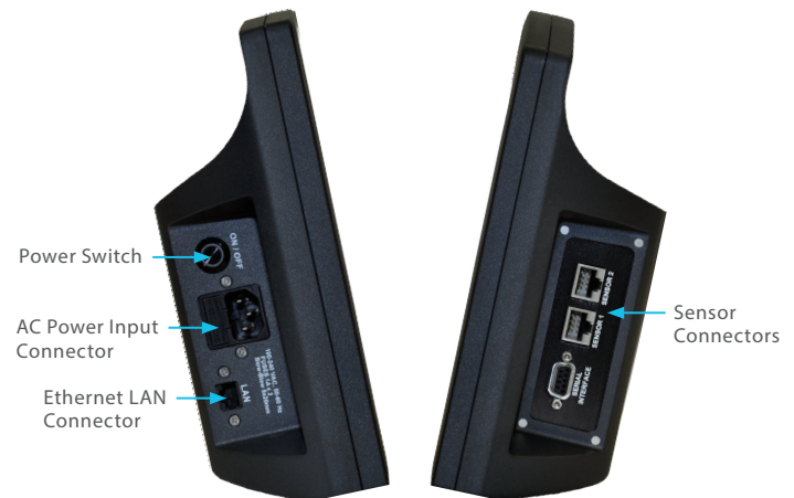
MODEL 4421A Side Views

The 4421A is the next generation replacement for the industry standard Model 4421. Building upon the original model's high level of accuracy and its ease of use, the new 4421A enhances the meter's functionality by utilizing a smaller/lighter design, and by providing the ability to have dual sensor inputs.